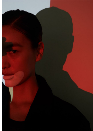
T-shirt - Foundation Yves Saint Laurent All'histoire Encre de Chine. Lipst - MAC PAINTSTICK X 12 PALETTE