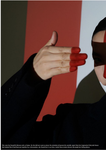
She wants her beautiful dresses only at home. For this she can use the extension of power by herself. After that her expressional dresscode became her husband like it had been put together by a dreamer... she found that it was him, inside their shared dress she made her feeling clear.